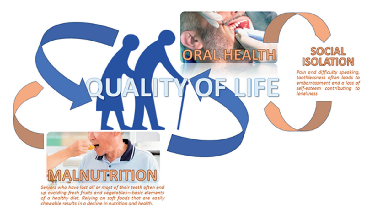
Fig. 1. Malnutrition and physical disability in older adults: a malnutrition-disability cycle.